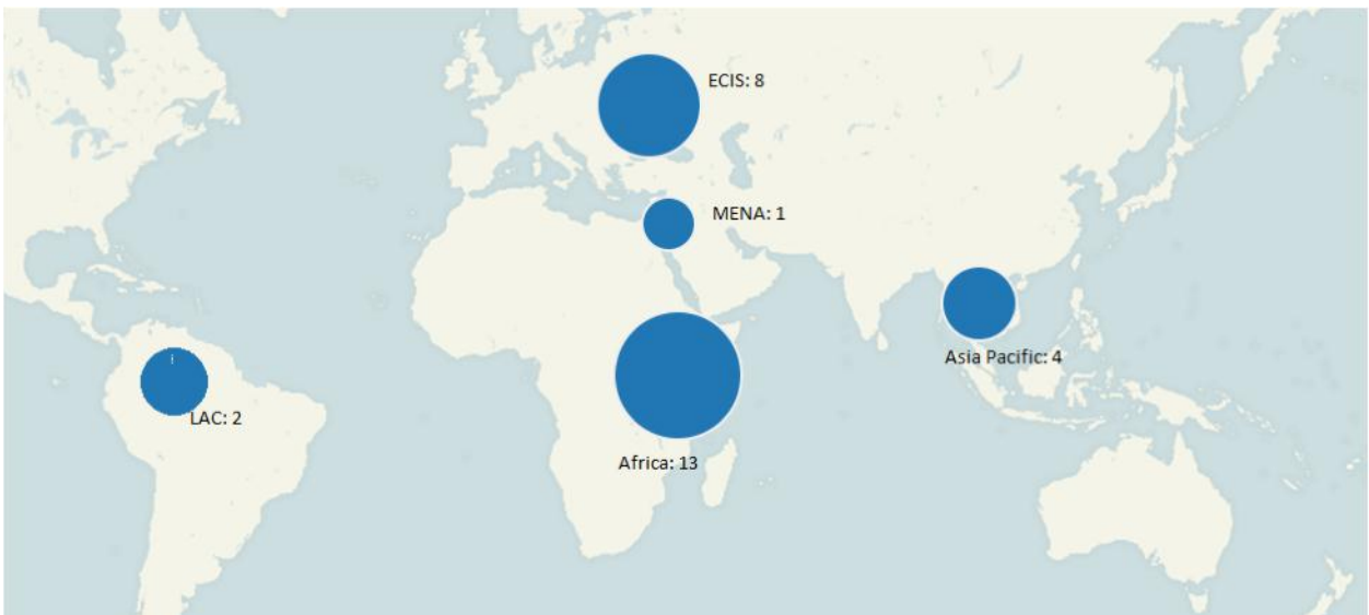
Figure 1: Geographical distribution of PDAs (as of 31 December 2013)